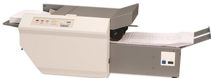
Shown with optional 18" conveyor