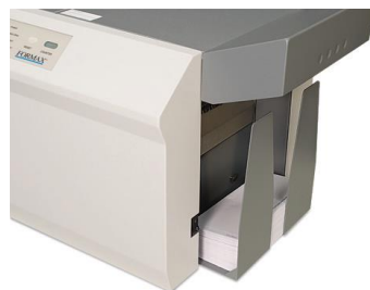
Standard Catch Tray