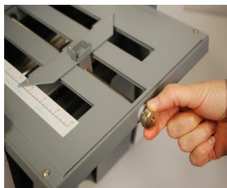
Sliding Fold Plates with Fine Tuning Knobs